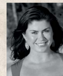
AMANDA LAMB OVERSEAS PROPERTY EXPERT